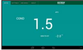
CONDENSATION / DEW POINT